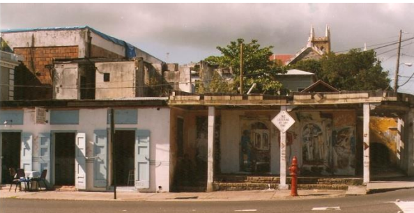
22A King Street, Sunday Market Square, Before and After