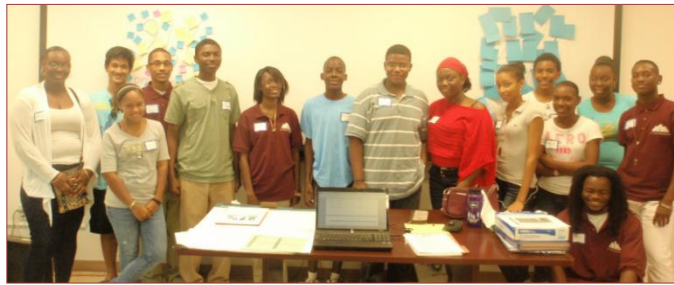
The Council conducts a community mapping workshop