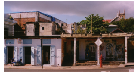
22A King Street BEFORE & AFTER

Today, the Sunday Market Square is now home to low income housing, the VI Police Department Bicycle Patrol, a law office, a brand new Small Business Incubator, and SCF's headquarters.