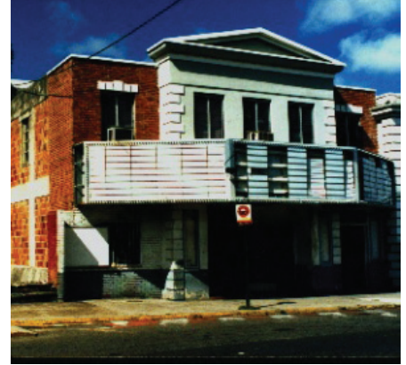
Old Alexander Theatre