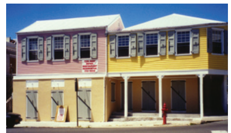
Sunday Market Square, Christiansted BEFORE & AFTER