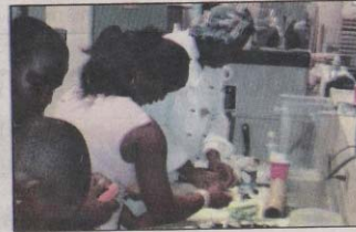
Culinary arts graduates Page 5

— Contact Aesha Duval at 774-8772 ext. 453 or e-mail aduval@dailynews.vi .